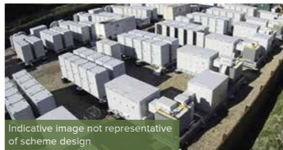
Indicative image not representative of scheme design

Energy storage can play a significant role in the UK's response to both the climate and biodiversity emergencies by supporting healthy ecosystems, whilst avoiding the emissions from fossil fuel burning power stations.